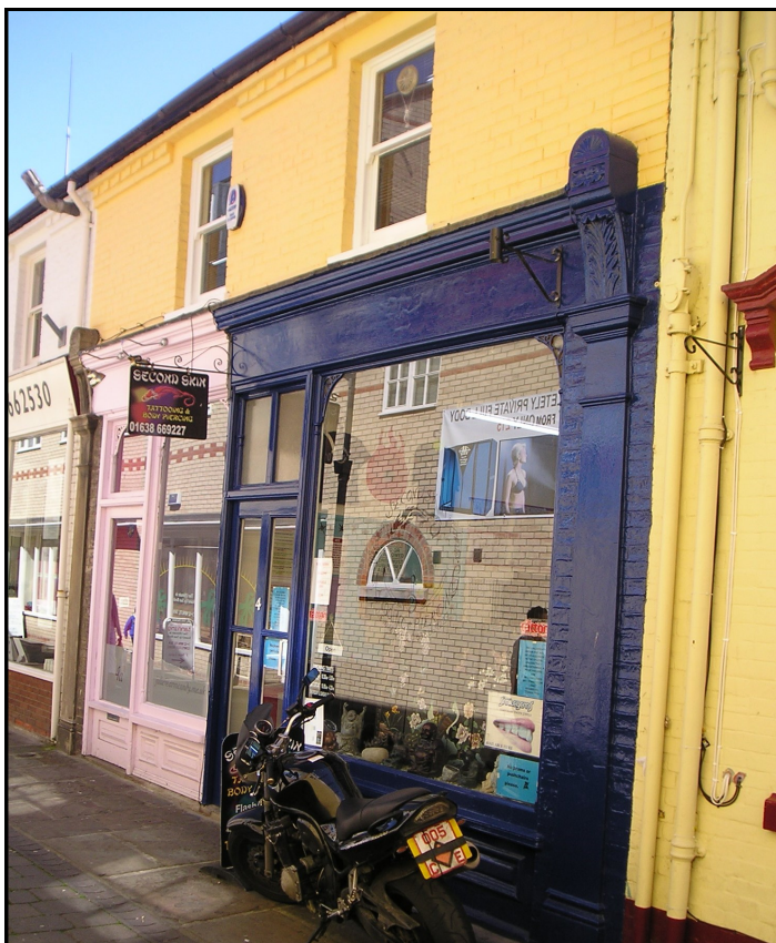
Traditional Shop Front

Sun Lane is now a secondary shopping street with pedestrian only access. There are shops and shop fronts on the southern side though blank walls face the visitor and potential shoppers to the east.