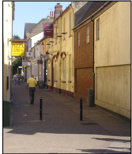
Sun Lane showing blank frontages to right and good quality paving.

Palace was destroyed by the Roundheads, part of Charles II mansion survives today in Palace Street. The buildings on the south side of Sun Lane were built over part of the 2 acre site of James I Palace.