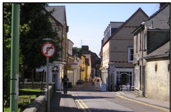
View from All Saints Road