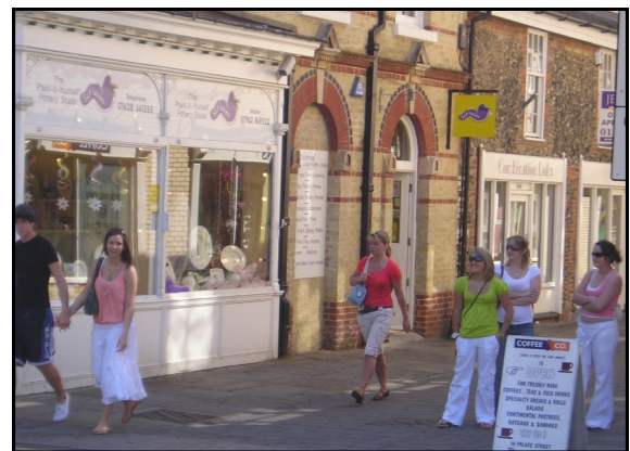
Pedestrian Shopping Street