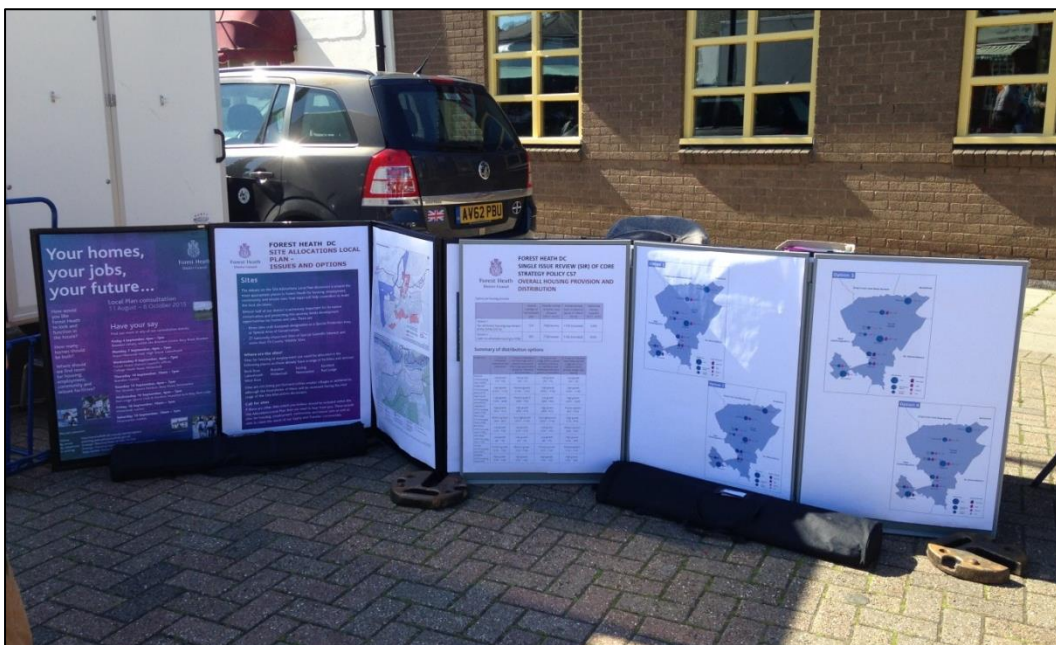
Figure 2. A2 poster boards at the Brandon Market Consultation event on 10 September 2015

5.9 A set of A2 poster boards were produced outlining the key ideas and the reasoning behind the consultation. These were used at the consultation events, an example of which can be seen below. Leaflets were distributed at the events detailing how people could respond to the consultation.