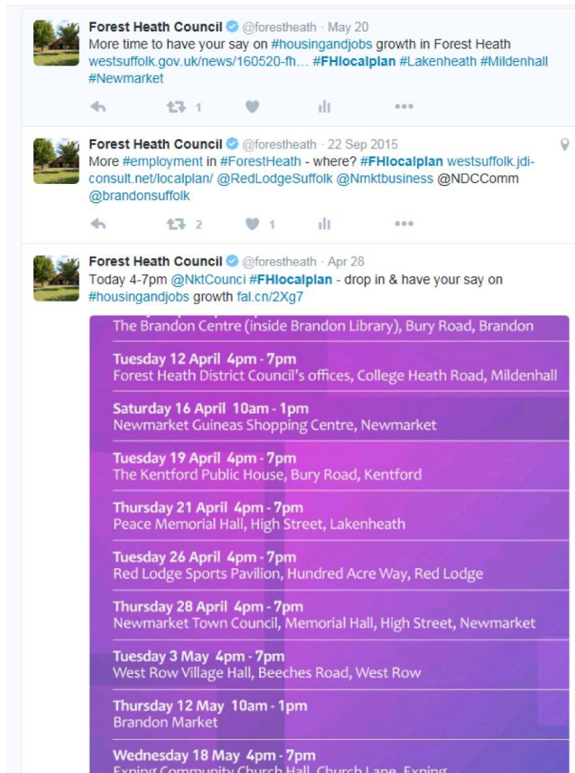
Figure 5. Forest Heath District Council's Twitter feed: 2016 Preferred Options consultation