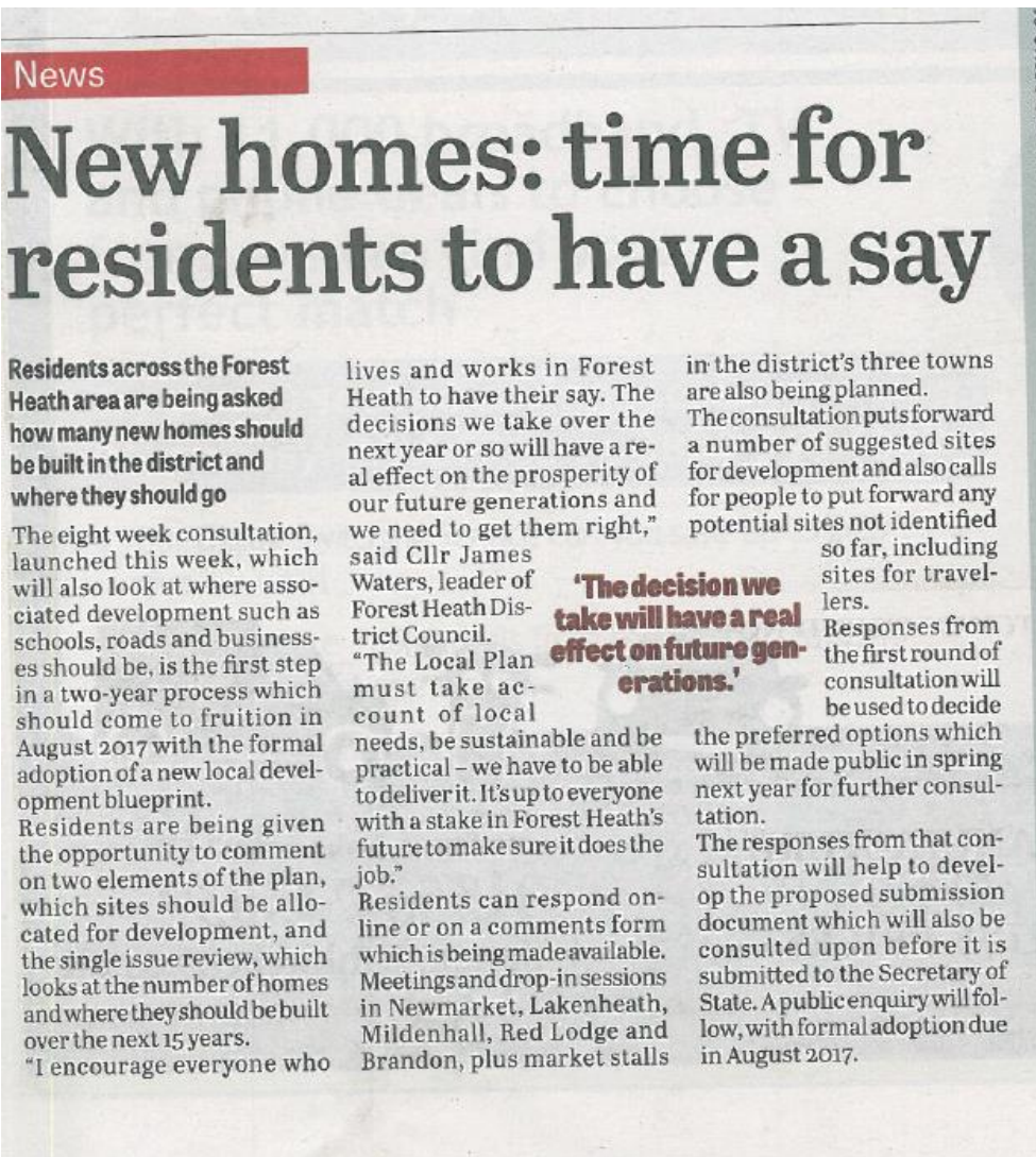
Figure 1. Extract from Mildenhall Journal 13 August 2015