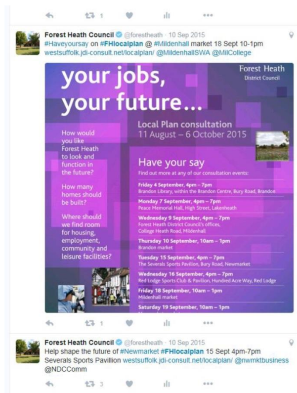
Figure 3. Forest Heath District Council's Twitter feed: 2015 Issues and Options consultation

5.11 The council's Twitter and Facebook feeds were used to advertise the consultation events and generate interest in the consultation. An example of the Tweets sent out to promote the 2015 consultation can be seen below.