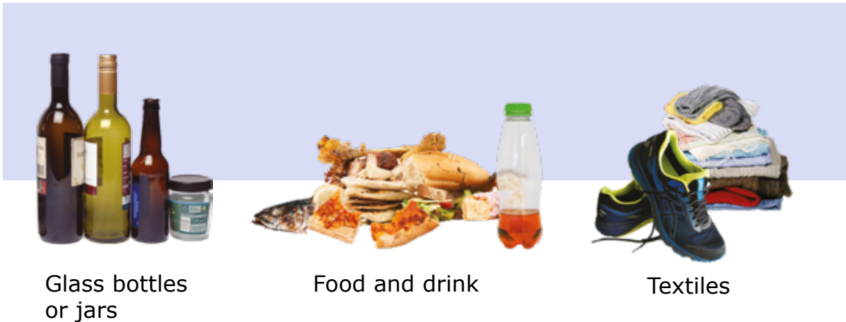
Glass bottles or jars