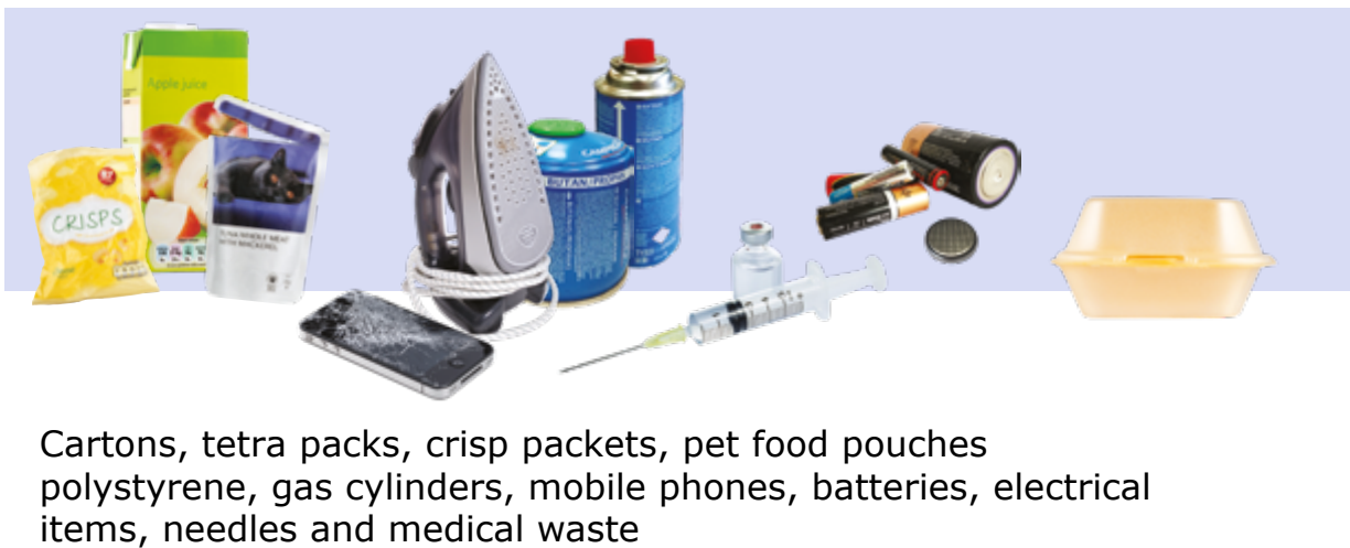
Cartons, tetra packs, crisp packets, pet food pouches polystyrene, gas cylinders, mobile phones, batteries, electrical items, needles and medical waste