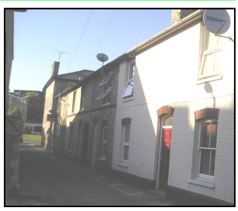
View of Church Lane

century between the stables and brewery buildings of the White Hart