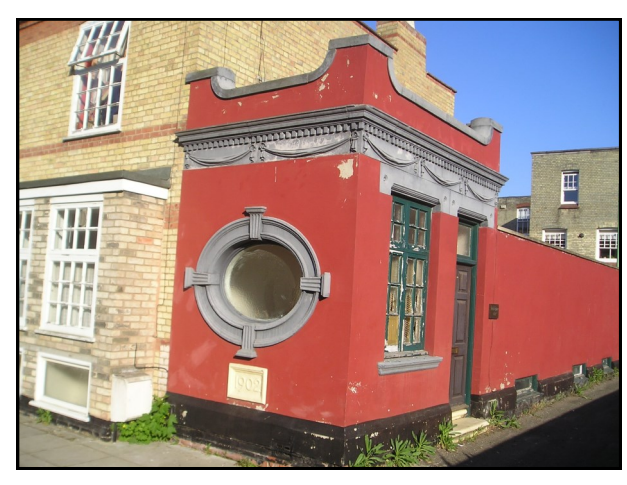
1902 Porch Rockingham Villas