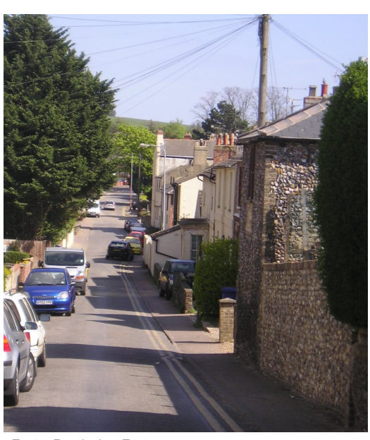
Exeter Road, view East

House Stables followed in the mid 19<sup>th</sup>-century. Industrial and commercial development took place on the north side of the street on previously undeveloped land in the 20thcentury.