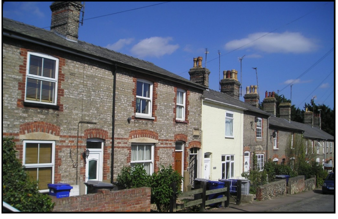
Replacement and traditional widows in adjoining houses