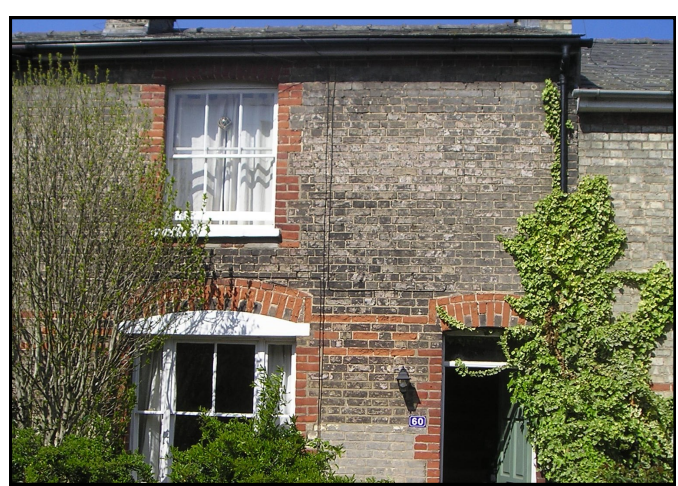
Unspoilt Terrace House No.60