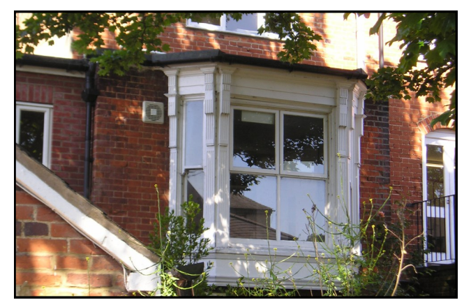
C2+ Oviel of Kingston House