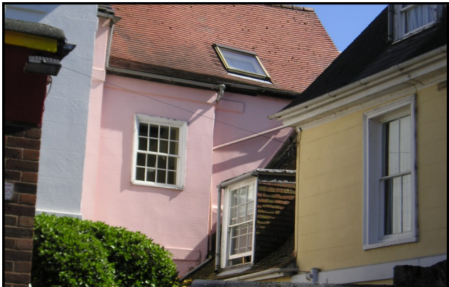
Georgian & Victorian sash windows