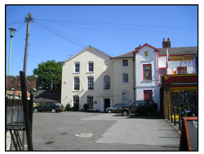
No. 85 & Marlborough Club