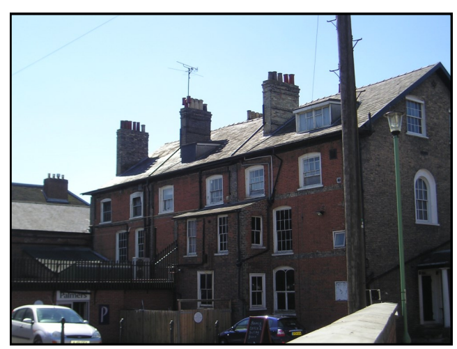
Rear York Buildings

Kingston Passage is an attractive short cut between the High Street and Park Lane.