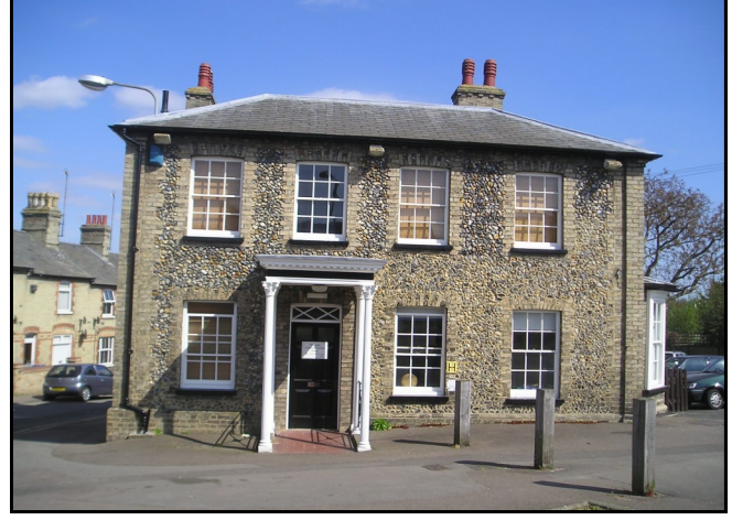
Former Mount Public House