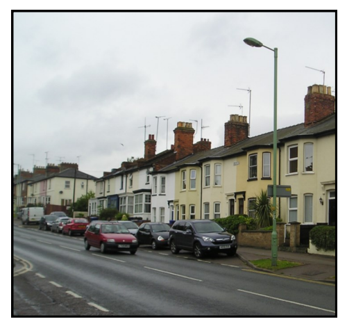
Mill Hill—View up the hill

The road is named after the mill which stood towards the brow of the hill, north of the