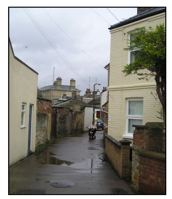
New Cut looking North