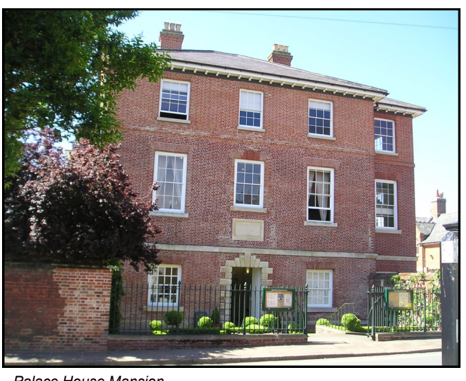
Palace House Mansion