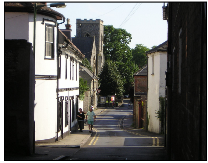
Palace Street & All Saints Church

Palace Street is the most architecturally and archaeologically significant street in Newmarket. It leads to Park Lane, All Saints Road and Sun Street. It is a quiet residential street containing Palace House Tourist Information and conference centre which is served by car parks in Rous Road and Park Road.