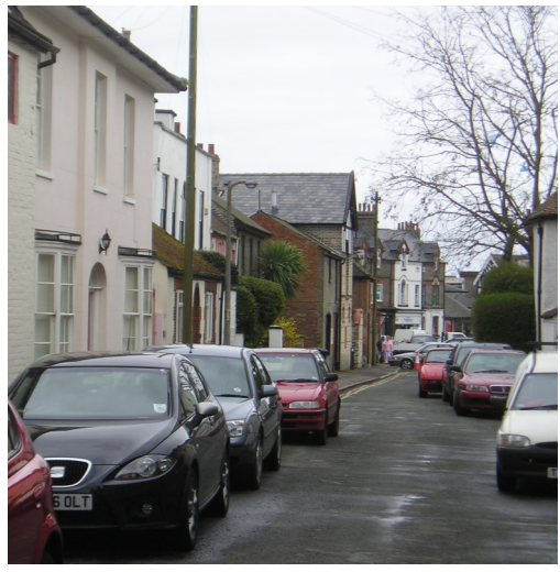
Sackville Street looking West

such as Cadland House known as Shagbag Street due Stables which has the oldest stable building in the town, Sackville House Stables, and the C18 range of Osborne House Stables.