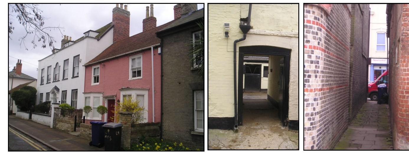
Boyce House & Havelock House

Pleasing architectural unity derived from the vertical proportion of doors and windows, the limited pallet of materials and the general domestic scale.