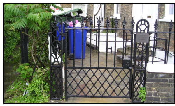
Wrought Iron Gates