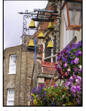
Five Bells Pub Sign