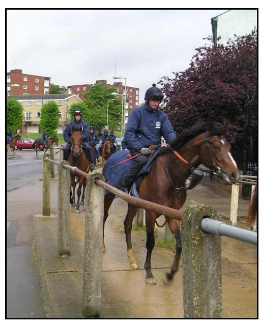
St Marys Square from Wellington Street

is St Mary's Parish Church and churchyard. The open space has been eroded by road widening and development on its west side. The buildings to south and east are of special architectural interest, many of them being listed.