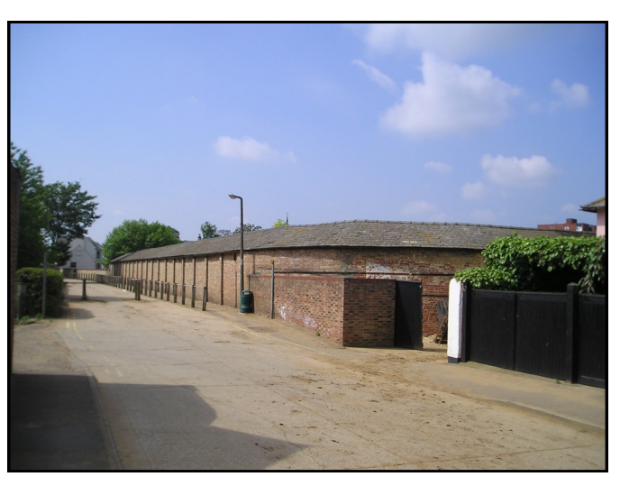
Saville House Covered ride C1835