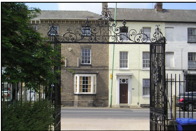
Fine Georgian Terrace seen through the wrought