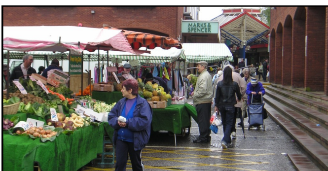
Open Air Market