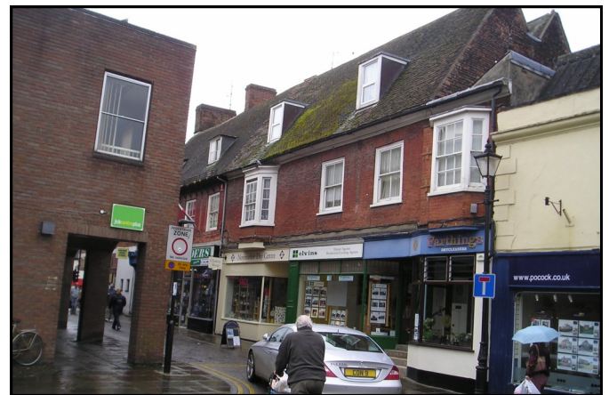
Former Fox & Goose Inn