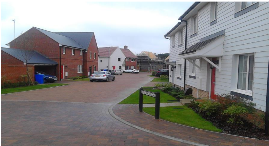
New homes built in the development at Kings Warren Red Lodge during the past year.

To date the development has already delivered fifty new homes and has paid £485,805.00 in s106 payments.