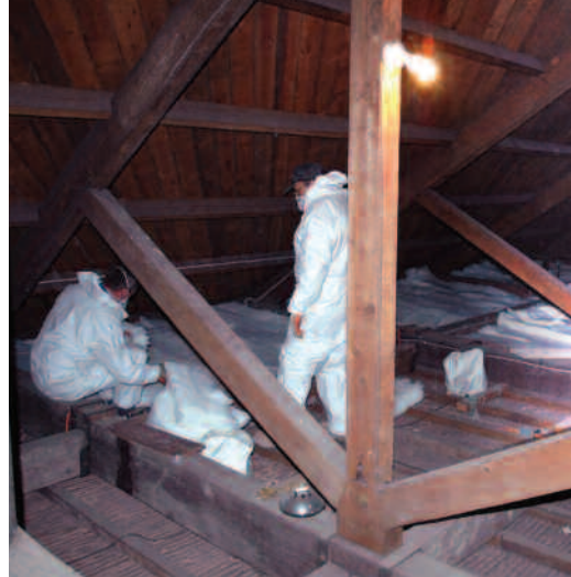
Image taken at Smiths Row Arts Gallery.

You can install any product listed on one of the following approved product lists: