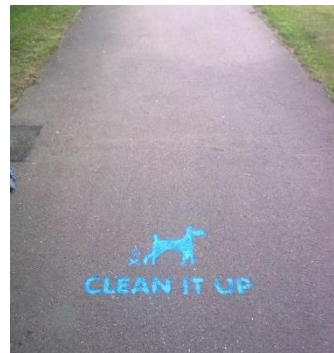
Road marker spray on tarmac path