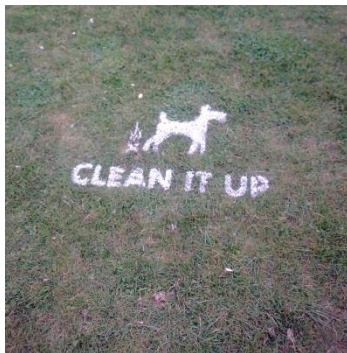
White line marker spray on grass

They are temporary but may last for several weeks. When sprayed on grass, the grass needs to be cut so it is fairly flat. Footpaths will also need to be flat and free from loose debris.